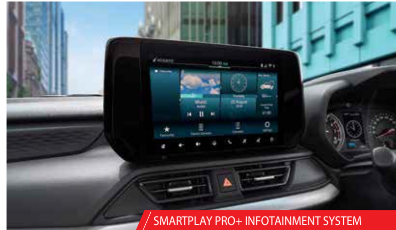
SMARTPLAY PRO+ INFOTAINMENT SYSTEM

No words can describe what you'll feel when you enter the Epic New Swift. But we'll try. This car is designed with ample space keeping your comfort in mind and its Sporty All-Black Interiors make every drive truly stylish. The real head-turner is the sleek and futuristic center console, with a driver-oriented cockpit for easy access.