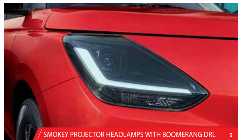
SMOKEY PROJECTOR HEADLAMPS WITH BOOMERANG DRL

With its bold stance and sporty design, the Epic New Swift is quite the looker. It is pure passion crafted into an expression of thrill. As it approaches, heartbeats go up, and you know it is something special.