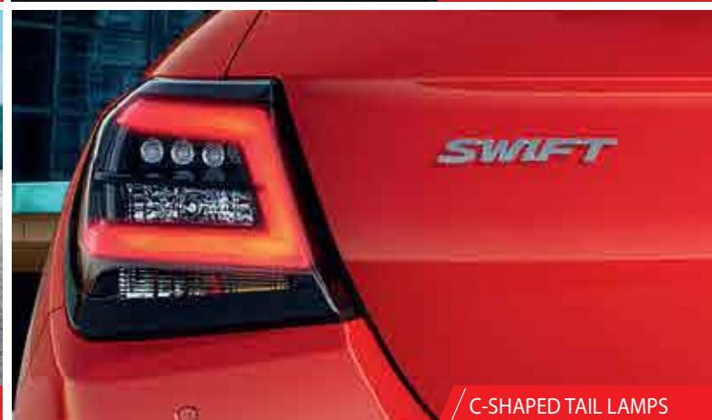
C-SHAPED TAIL LAMPS