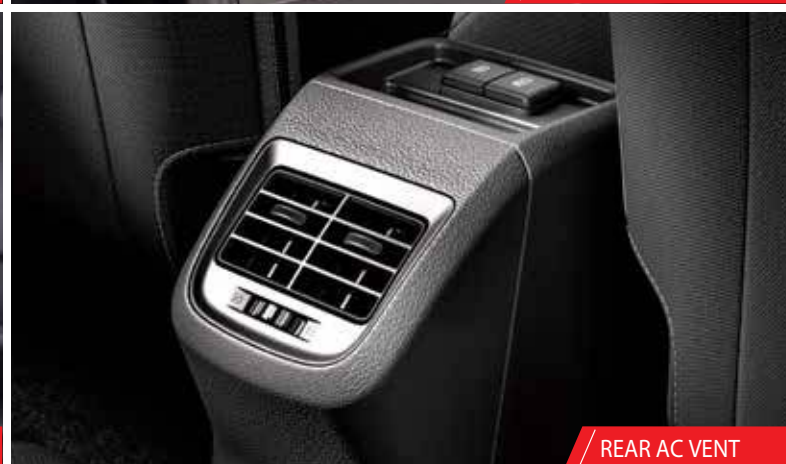
REAR AC VENT