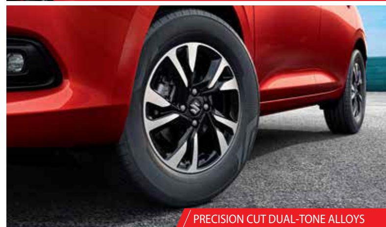
PRECISION CUT DUAL-TONE ALLOYS