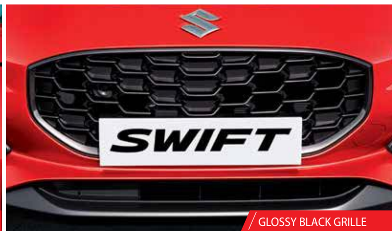
GLOSSY BLACK GRILLE