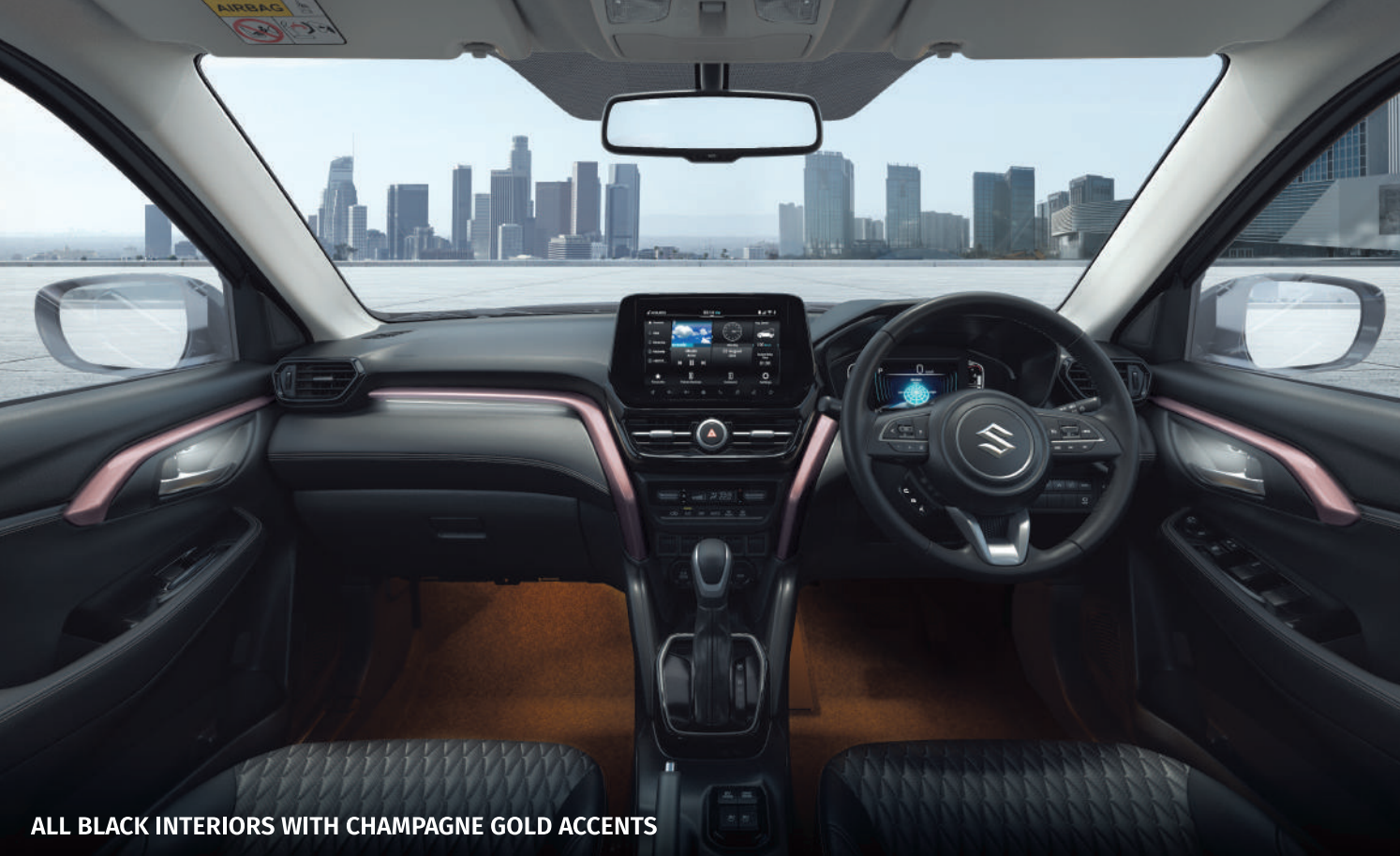
ALL BLACK INTERIORS WITH CHAMPAGNE GOLD ACCENTS