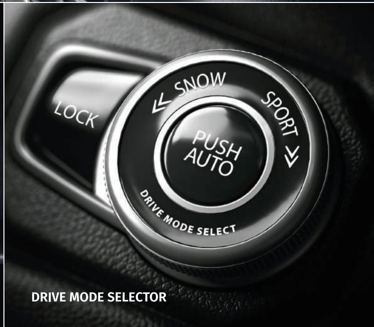
DRIVE MODE SELECTOR