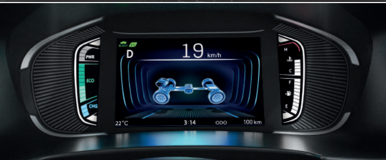
DIGITAL INSTRUMENT CLUSTER