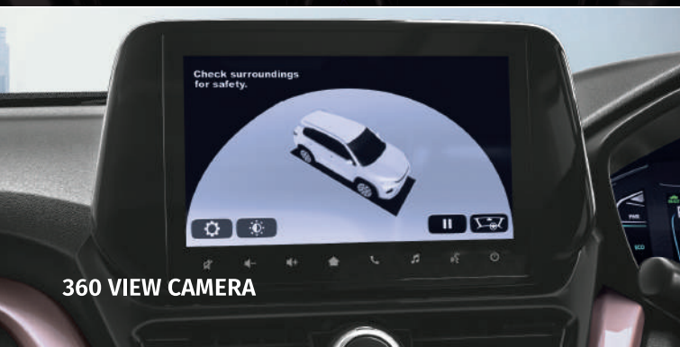
360 VIEW CAMERA