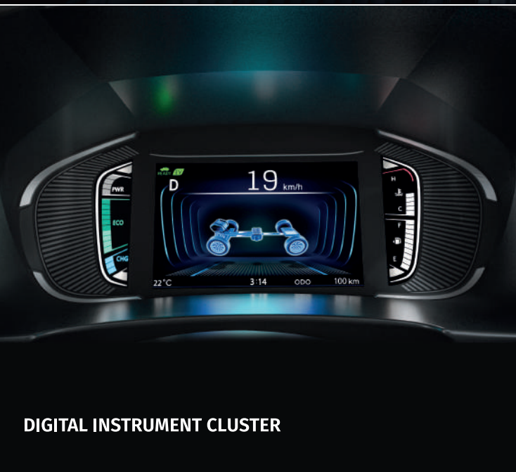
DIGITAL INSTRUMENT CLUSTER