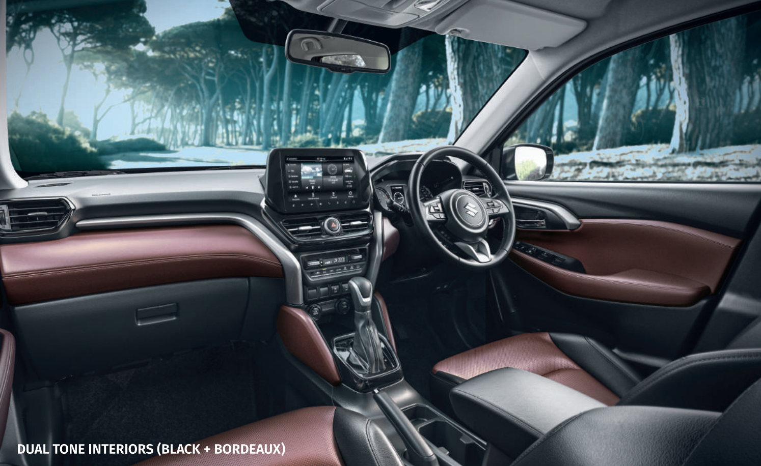
DUAL TONE INTERIORS (BLACK + BORDEAUX)