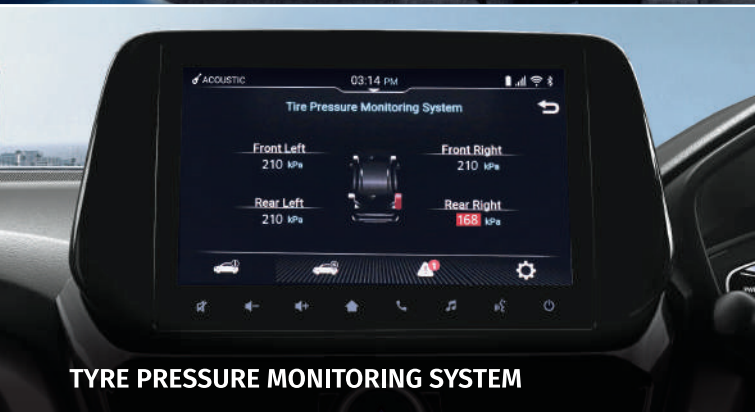
TYRE PRESSURE MONITORING SYSTEM