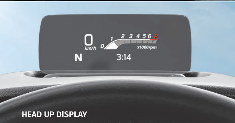
HEAD UP DISPLAY