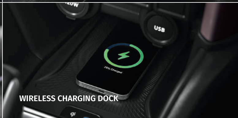
WIRELESS CHARGING DOCK